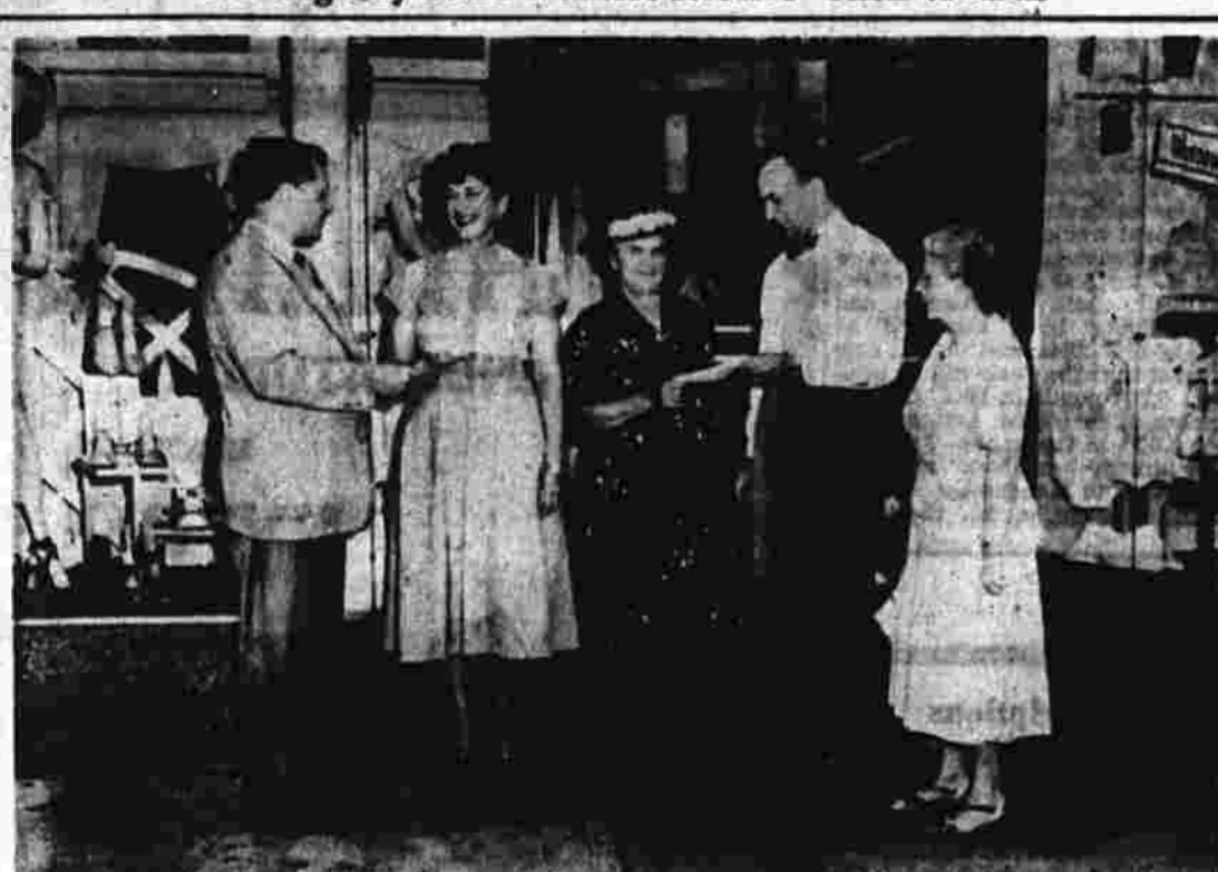
Retail Bureau during Red Tag Days last week are shown receiving their awards...